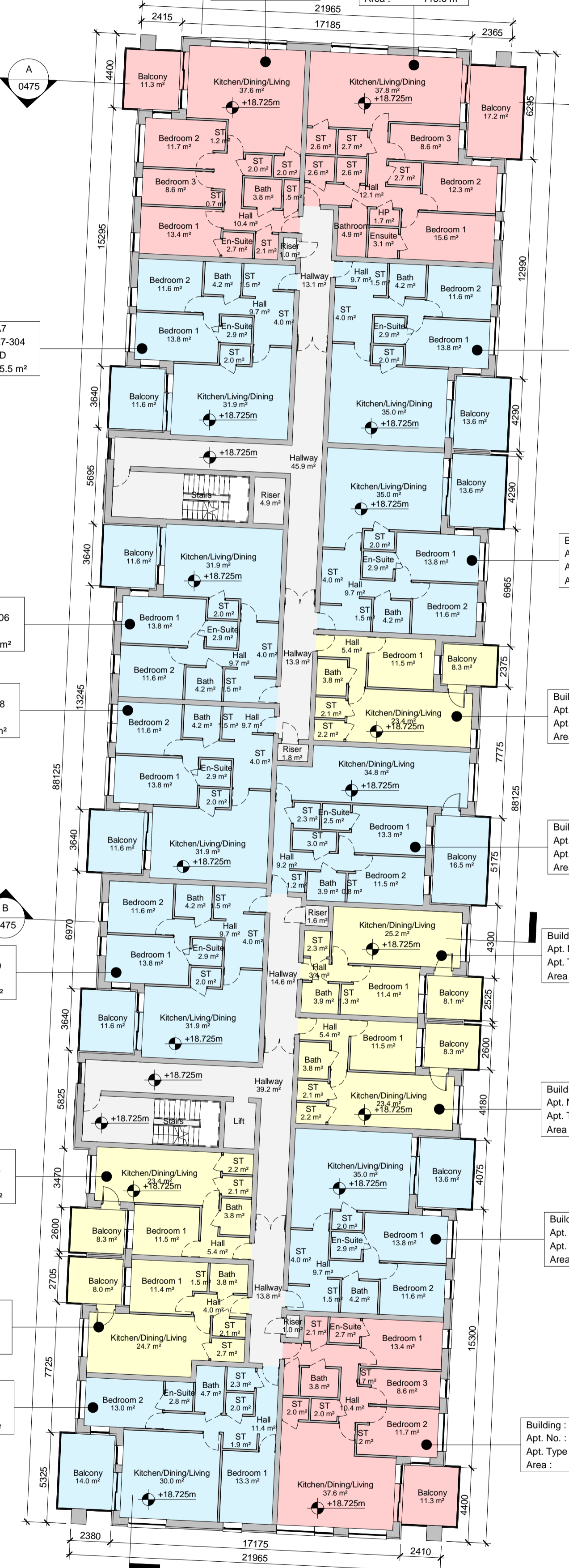
1 Third Floor Plan 1 : 200