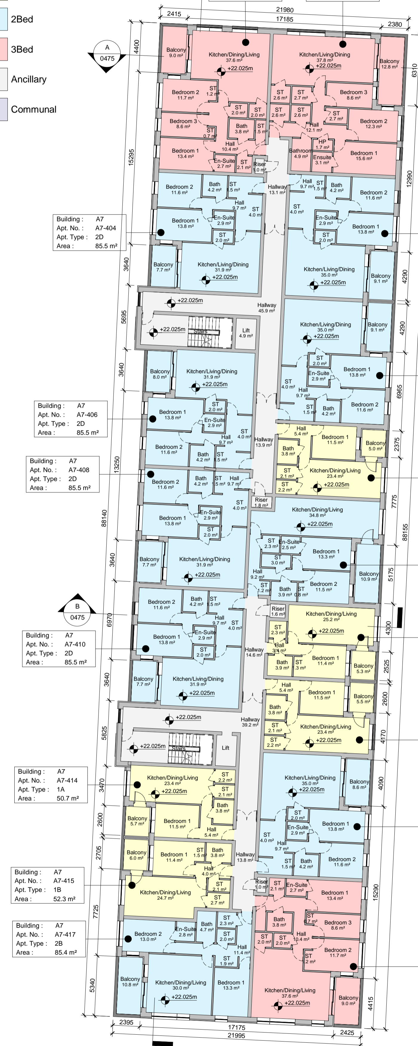
2 Fourth Floor Plan 1 : 200