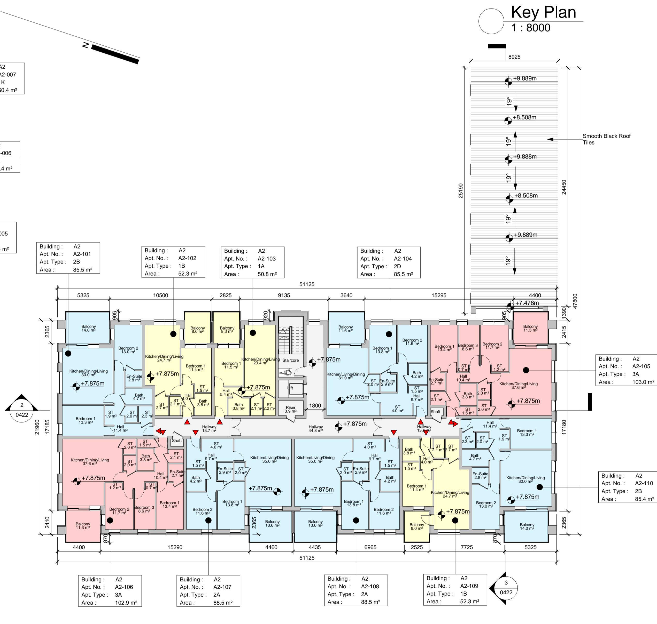
2 First Floor Plan 1:200

NOTE: Refer to Architect's Design Statement for selected material & finishes on buildings.