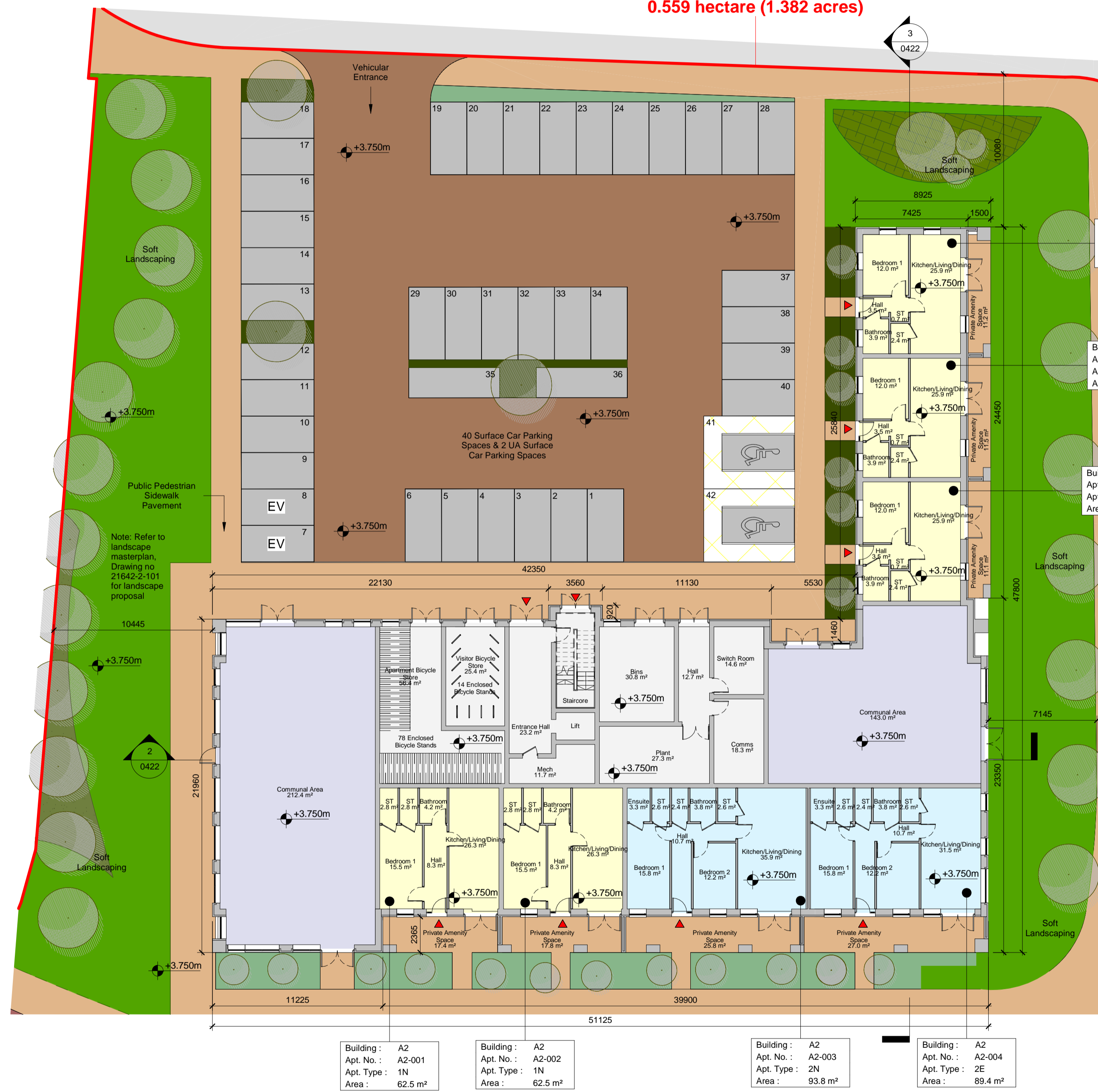
1 Ground Floor Plan 1:200

Castlelake South Site 02 0.559 hectare (1.382 acres)